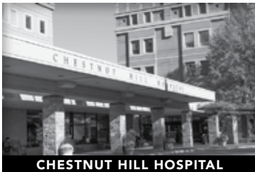
CHESTNUT HILL HOSPITAL