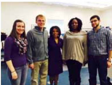
ACOI President Judith Lightfoot, DO, Visiting Professor at WVSOM in November, 2014.

With the stock market continuing to do well, ACOI members might consider supporting the Generational Advancement Fund with a gift of appreciated publicly-traded stocks. A gift of stocks or bonds held more than a year that has grown in value, not only qualifies for a charitable-contribution deduction (based on the fair market value), but also avoids capital gains tax on the appreciated portion of the gift.